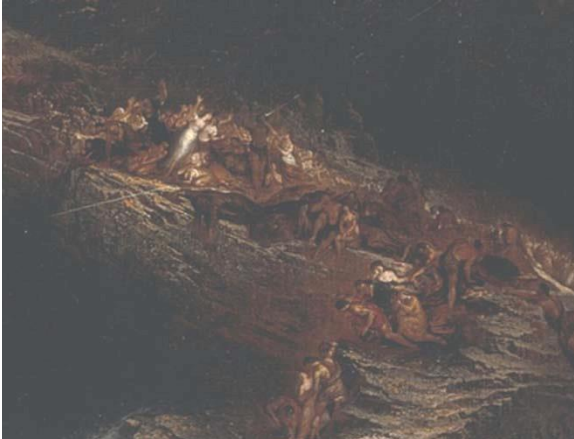
John Martin, The Deluge (detail)

insignificant role of top dressing on a rock of ages.” 2 From their twenty-minute session of simply listing what they had seen, the Fellows focused instead on the images of damned humanity in The Deluge as figures not only to be taken seriously as central to the meaning of the painting but also to be accorded sympathy and even admiration.